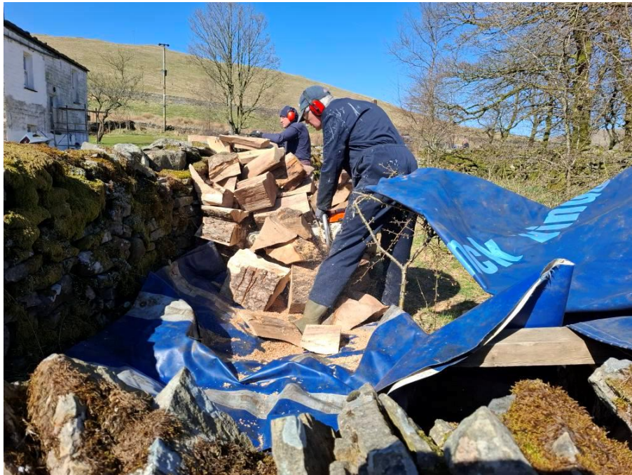
Productive Working Weekend