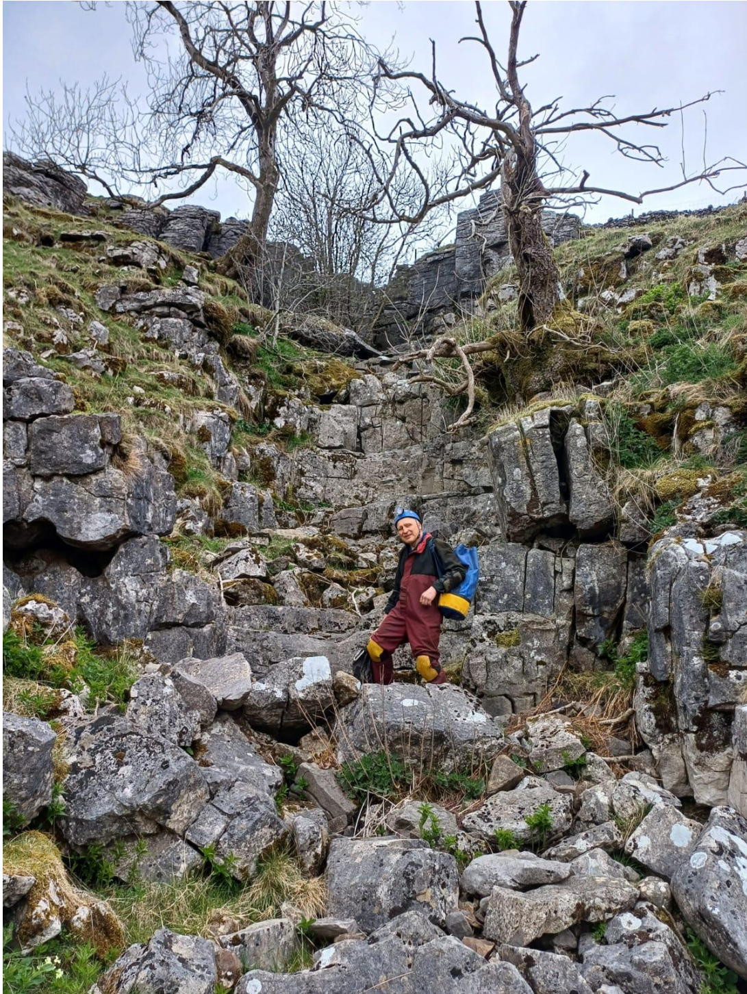
Dalek at Snatcher Pot