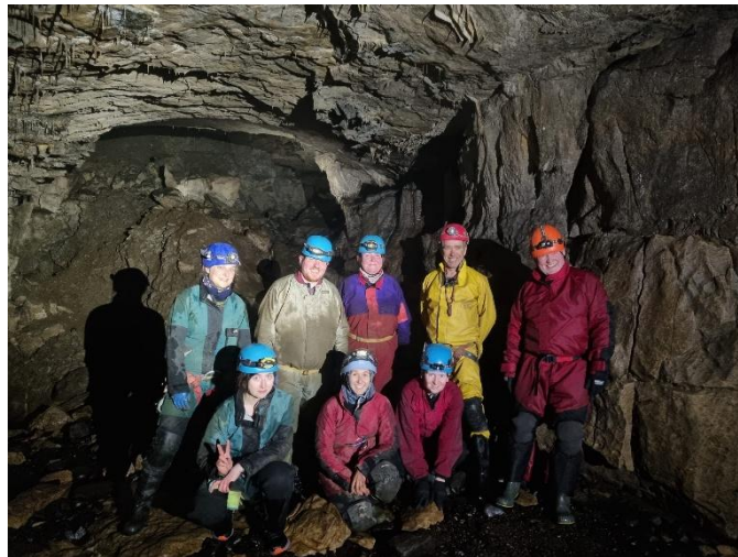
New to caving event 2025